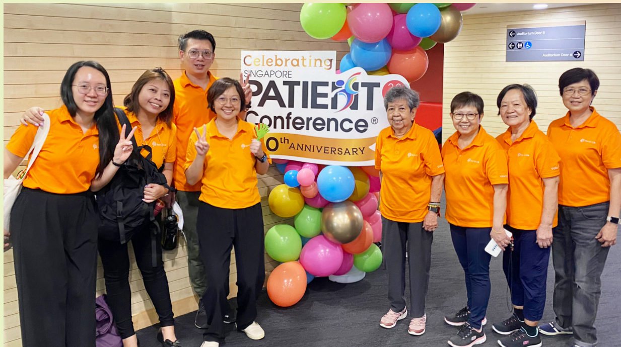
Aspiration and Twinklehearts groups at the Singapore Patient Conference where they received the Singapore Patient Action Awards 2022