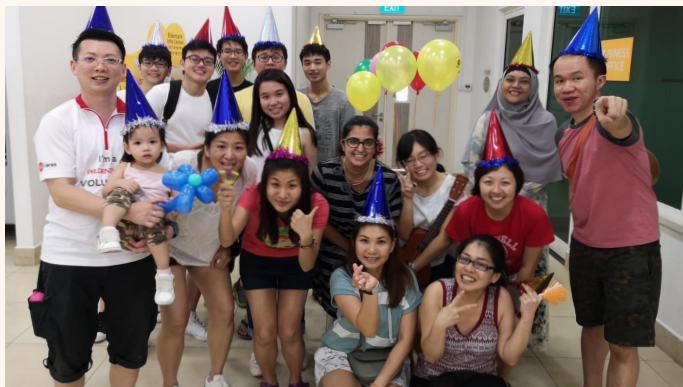
Aspiration and Twinklehearts groups in action

had been serving with Ren Ci for more than a decade. Six of them gave more than 25 years of their time, love and dedication to the residents. The oldest volunteer is 79 years of age this year and she had been volunteering with Ren Ci for the past 25 years. We are truly inspired and humbled by her sheer commitment and dedication.