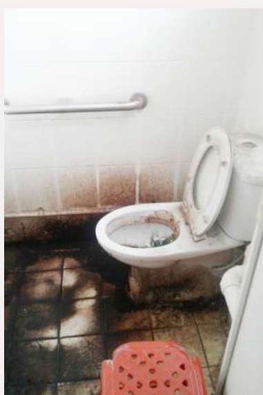
Ren Ci's care team helping our patients with hoarding tendency.